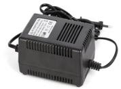
AC24V/3A Power Adapter